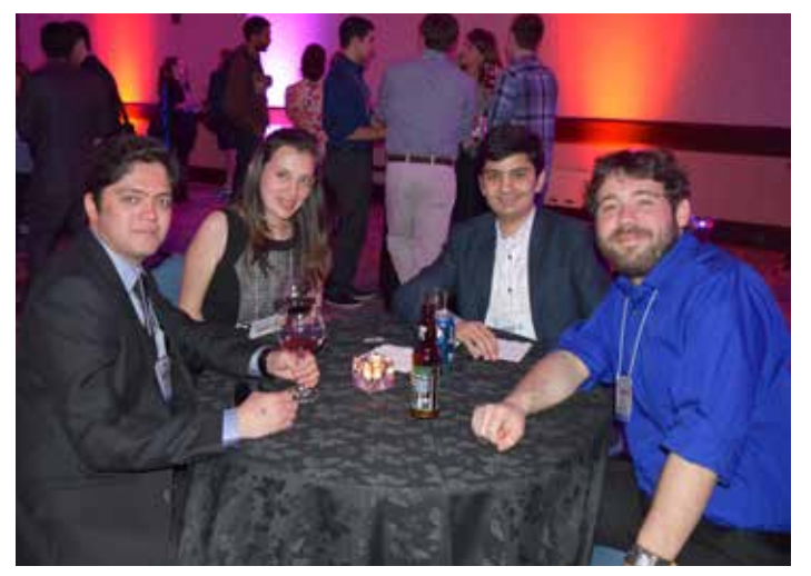
ASPET Student/Postdoc Mixer

Following the poster competition, ASPET Students and Postdocs let their hair down at the Student/Postdoc mixer. Young members enjoyed drinks, dessert, and dancing!