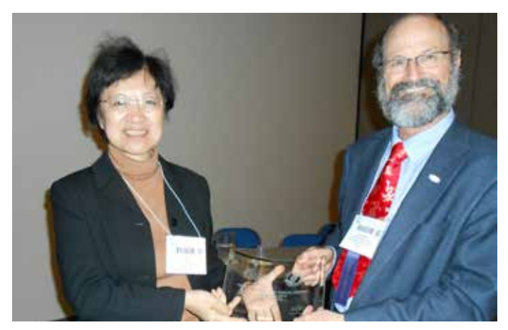
ASPET hosted a welcoming ceremony for visiting CNPHARS members.

ASPET booth had great traffic with both member and non-member visitors. We signed up 42 new members and showcased our newly branded marketing materials, brochures, flyers, and products. If you haven't already had a chance to view our new Guide to Member Benefits brochure, be sure to take the time to download it now at <a href="https://www.aspet.org/Guide_to_Member_Benefits">www.aspet.org/Guide_to_Member_Benefits</a>. As part of our re-branding efforts, this new guide was created to make sure our members are taking full advantage of ASPET membership. Also at the booth, we sold t-shirts, hats, plush donkeys, lunch bags, and mugs featuring our new logo. If you didn't get an ASPET logo'd product, you can still make purchases online at <a href="https://www.aspet.org/store">www.aspet.org/store</a>.