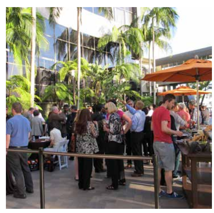
Members enjoy the closing reception poolside at the Marriott

As the 2014 Annual Meeting drew to a close, ASPET members attended the closing reception, which was held poolside at the Marriott Marquis on Wednesday, April 30. With perfect weather and a great turnout, members enjoyed one last social event before heading home.