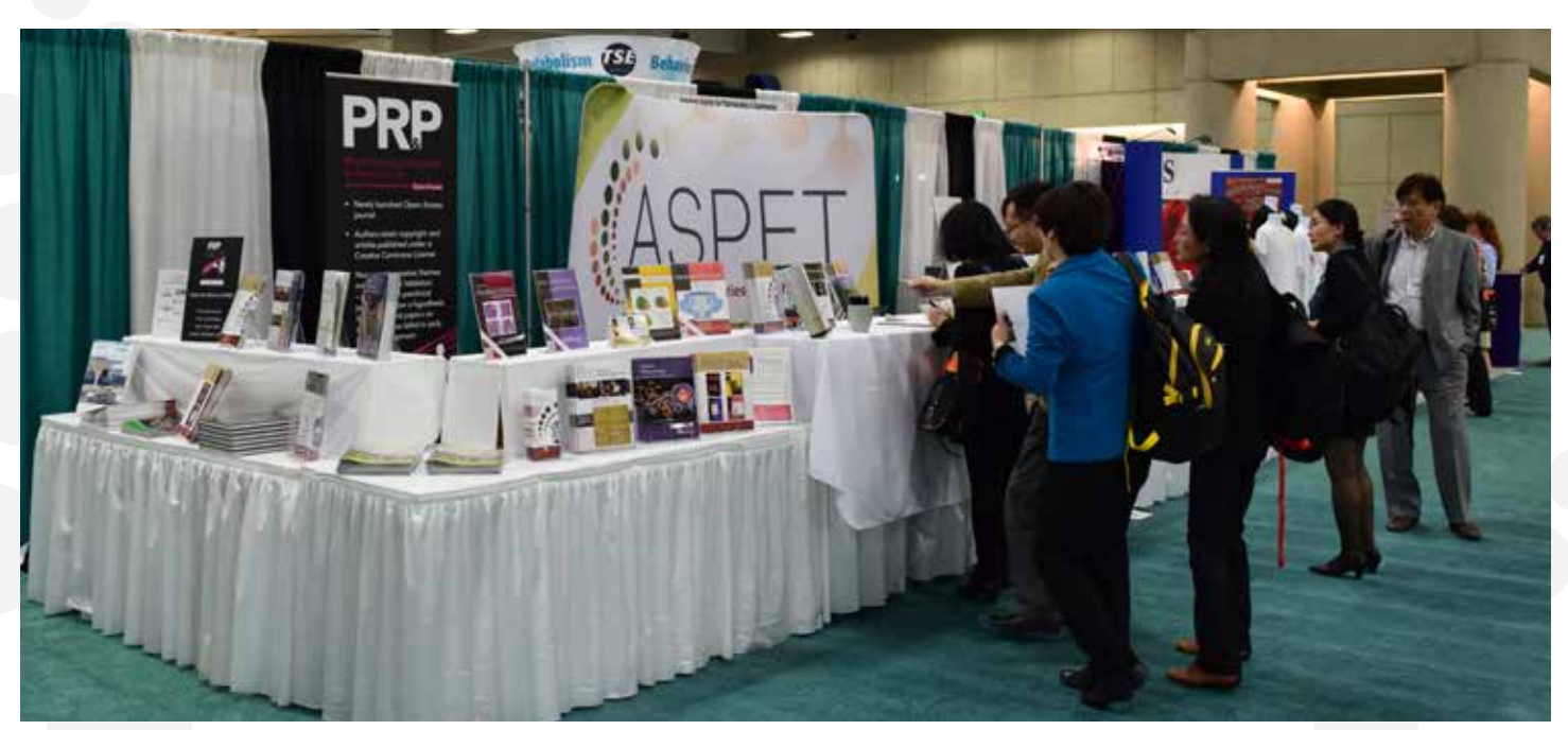
ASPET Exhibit Hall Booth