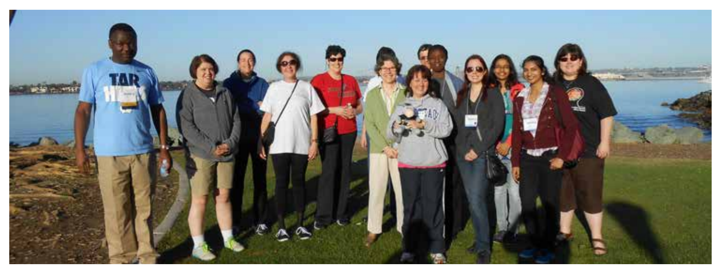
Members enjoy a nice walk along the San Diego harbor

To view the full album of EB 2014 pictures, visit us online at: http://bit.ly/SOfcAn