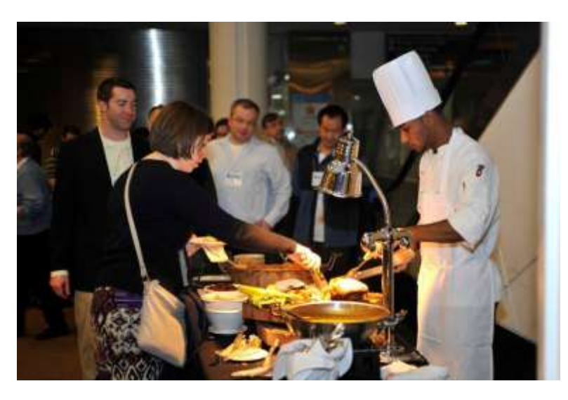
Meeting attendees enjoy refreshments and socializing at the ASPET/British Pharmacological Society Opening Reception following the ASPET Business Meeting.